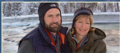
Wake and Kinlen Sacred Pathways

This is a true journey through fire and ice, and into the depths of the stars. Join us in ceremony at the top of the world, as we offer our gifts, and invite the energy of this wild place to inform the whole of our experience.